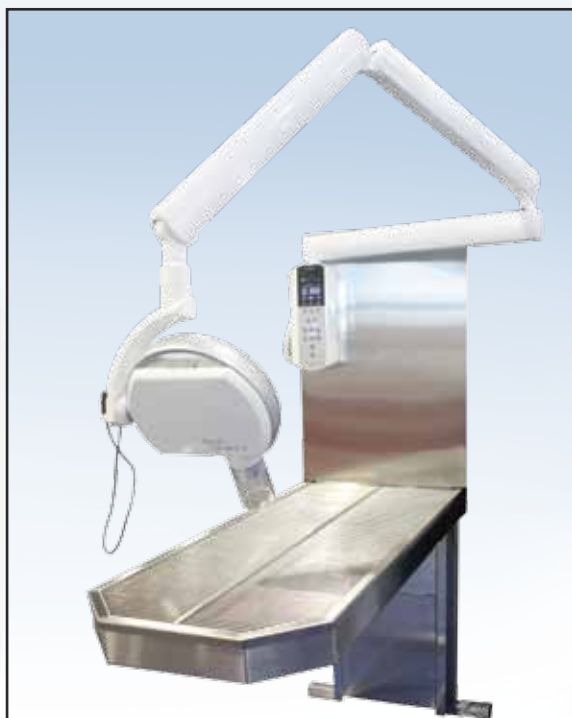
X-Mind™ unity mounted on Dental Focus™, LLC Dental Wet Lift Table. Contact Dental Focus™, LLC at (908) 336-8790 or visit www.dentalfocus.biz for more detail options.