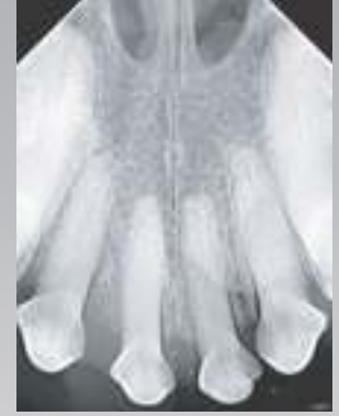
SOPIX at 0.20 seconds