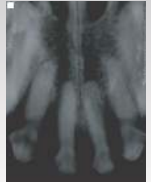
Competitor sensor at 0.20 seconds