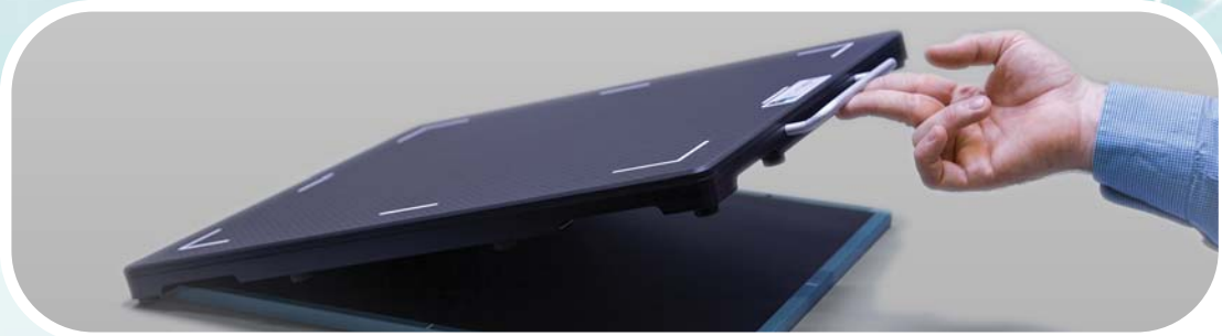
Easy Lift Handle

This product is perfect for bariatric, equine, and podiatry procedures.