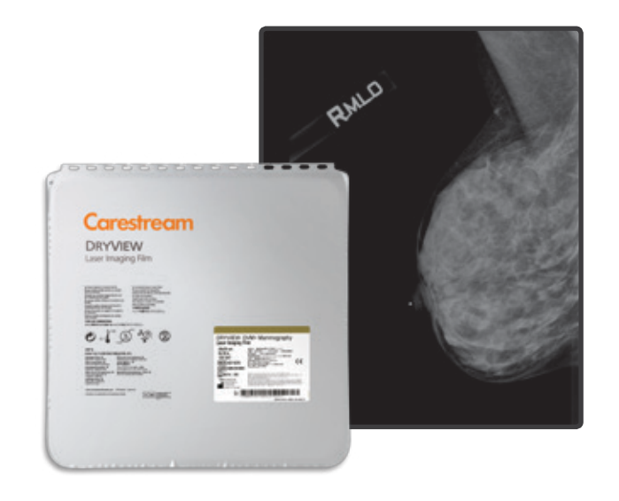
DRYVIEW film delivers high film densities preferred for mammography applications.

For mid-to high-volume environments, the high-speed DRYVIEW 6950 Laser Imager can keep your operation running smoothly and efficiently even during your busiest periods. The system delivers from 160 to 250 films per hour with extremely sharp 650 ppi resolution on every film size. With this performance you can rest assured that as advancements in modalities occur, you'll be equipped for the future.